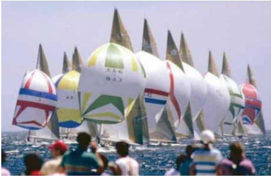
The Twelve Meter World Championships in Freemantle, Australia was a lead up to the America's Cup Races. It drew the largest gathering of 12 Meters ever on a race course.