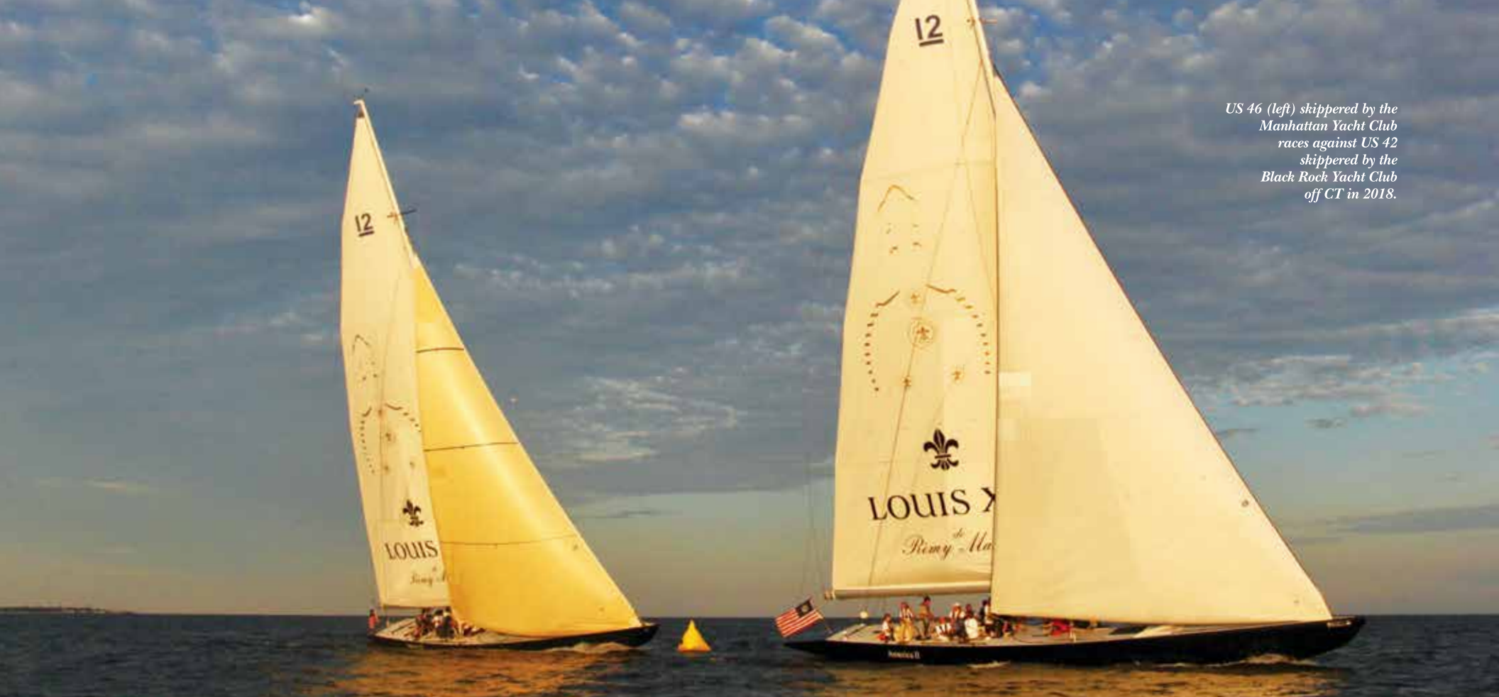
US 46 (left) skippered by the Manhattan Yacht Club races against US 42 skippered by the Black Rock Yacht Club off CT in 2018.