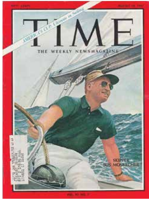
1967 – Intrepid from the United States races against Dame Pattie from Australia.

The 12 Meter class has inspired many generations of sailors. They are iconic and majestic boats and they personify the timeless beauty of sailing. In the United States, 12 Meters are the pinnacle of American yachting tradition. Here are some of the 12 Meters and personalities who have competed in the America's Cup.