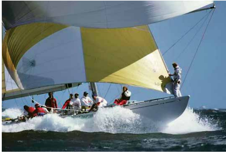
US 46 was originally painted white when she sailed in the 1987 Cup Races.