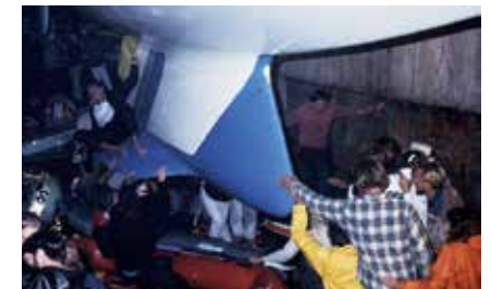
1983 – Liberty from the United States races against Australia II. Australia II wins and the America's Cup moves to Freemantle, Australia.