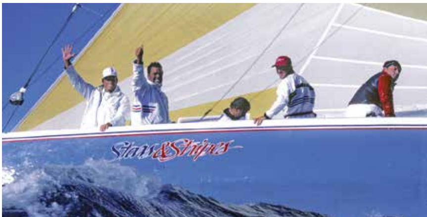
Dennis Conner, Mr. America's Cup, gives his thumbs salute.

When the New York Yacht Club lost the America's Cup in 1983, the races moved to Australia and many more nations got involved. This made the 1987 America's Cup races the greatest show ever. It was also when ESPN began broadcasting Cup races on television, attracting new interest to the sport of sailing.