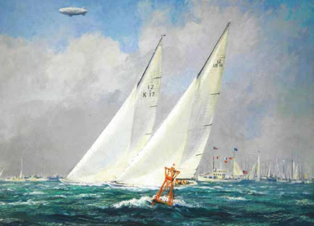
Sceptre from the United Kingdom races Columbia from the United States in 1958 off Newport RI. This was the first America's Cup competition in Twelve Meters.