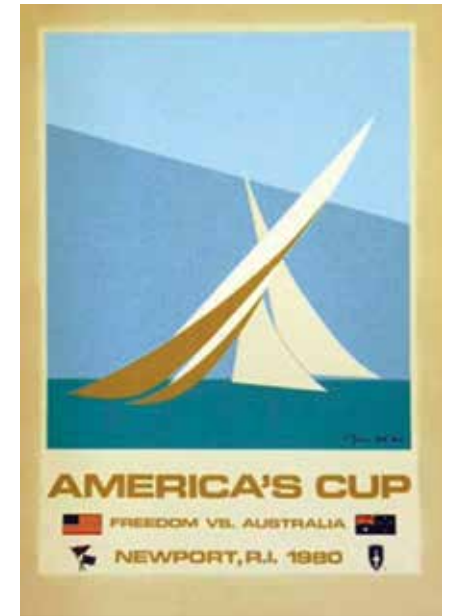
1980 – Freedom from the United States races against Australia.